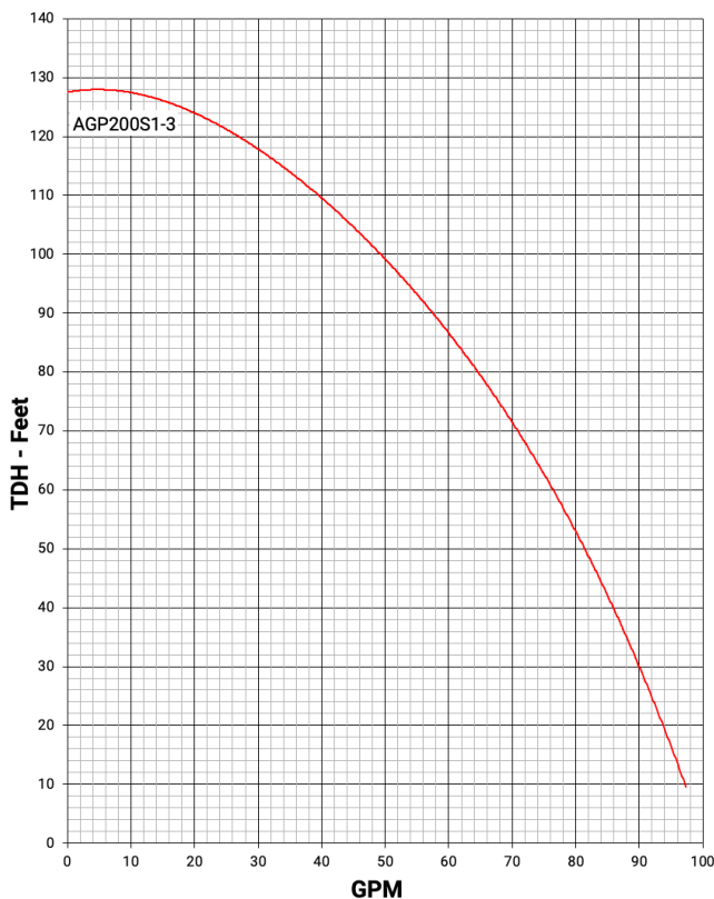
Performance @ 230V; SG = 0.78