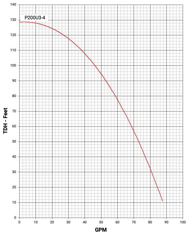
Performance @ 230V; SG = 0.78