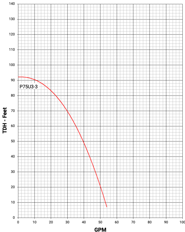
Performance @ 230V; SG = 0.78