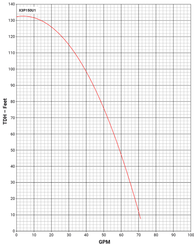
Performance @ 230V; SG=0.78