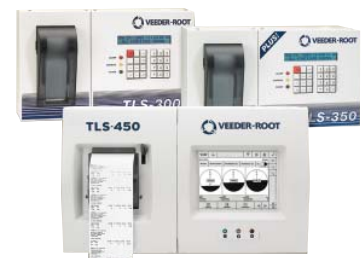
Scalable TLS portfolio: TLS-300, TLS-350, TLS-450

To configure the right Veeder-Root AST monitoring system for your sites, contact a Veeder-Root Distributor or visit www.veeder.com .