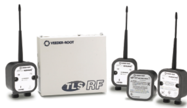
TLS-RF Wireless 2 System: TLS-RF Unit, Receiver, Repeater, Mag-XL Battery Powered Transmitter

The TLS-RF Wireless 2 Kit reduces installation time and eliminates costly wiring from the tank to the TLS Console.